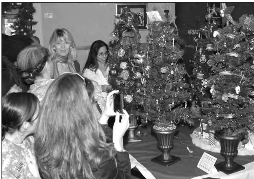
Community members look at some of the trees that will be available for auction at the Holiday Bazaar Dec. 4.

The Red Cross donated "collector" ornaments to go on their vintage style tree. The USARAF FRG's tree has ornaments that came all the way from the continent of Africa, the 14th Transportation's tree